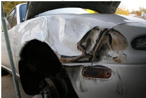
Wrinkle, wrinkle, little car...