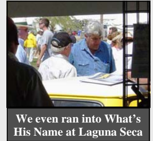
We even ran into What's His Name at Laguna Seca